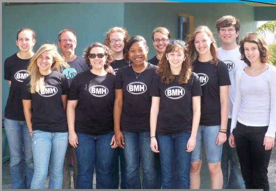
Bahamas Methodist Habitat Work Team 2011